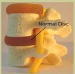
A normal disc is a shock absorbing structure that separates the vertebrae that protect your spinal cord. Injury and wear can make discs lose their fluid and compress.

The DRX9000™ (Lower Back) and DRX9000C™ (Neck) Spinal Decompression Systems work by gently separating the vertebrae above and below the involved disc . This separation causes a negative pressure to be exerted on the disc creating a vacuum effect.